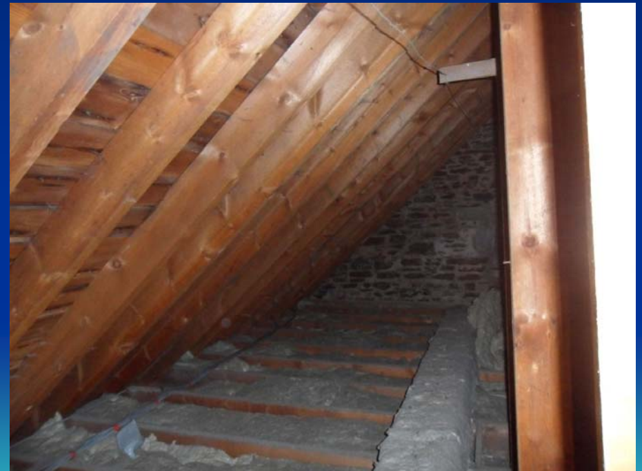
Crawling through torch-lit lofts