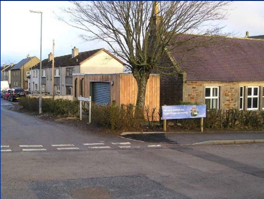
Newmill Hall Boiler, near Keith